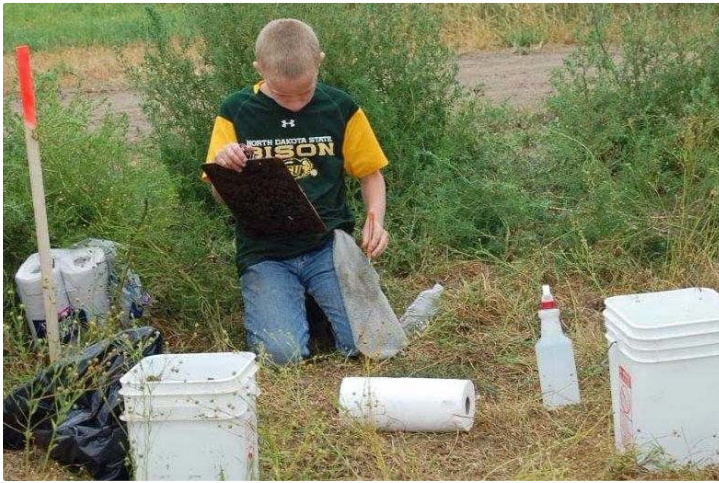
Figure 3. Contestant determines textures.

Start: Take about 1 tablespoon of soil and wet by adding water in small amounts (don't drown it!). Knead it with your fingers in one hand until the soil is plasticlike and moldable (if possible) like moist putty.