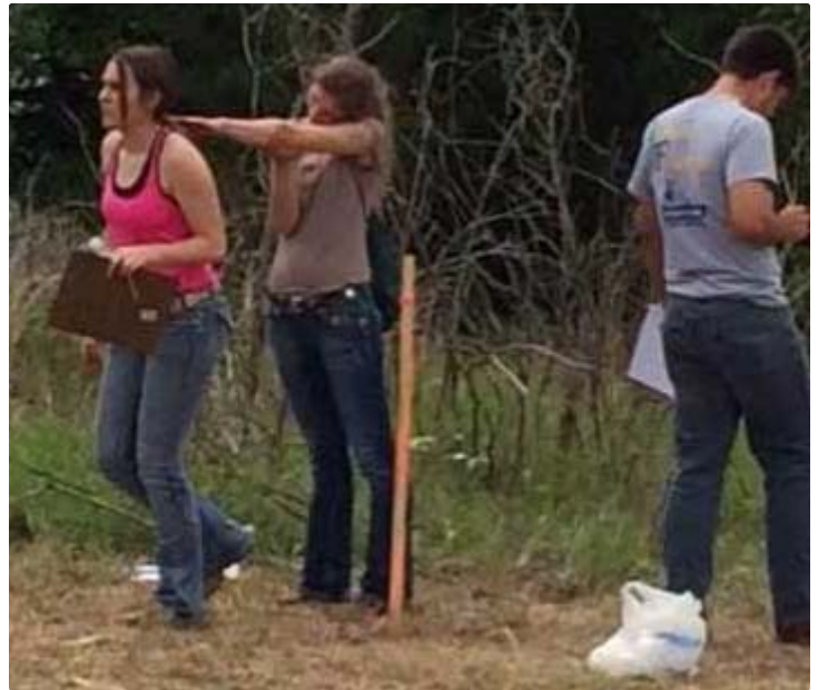
Figure 4. Contestants determining slope.