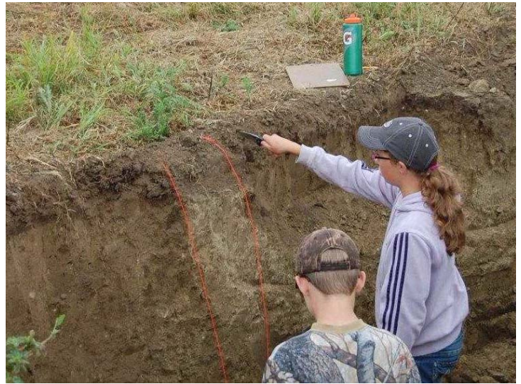
A “no-touch” zone described in a pit.

Provide a five-minute interval for travel between sites. Group 1 then goes to site 2. Group 2 goes to site 3, Group 3 goes to site 4 and Group 4 goes to site 1. This round-robin continues until each group has judged all four sites.