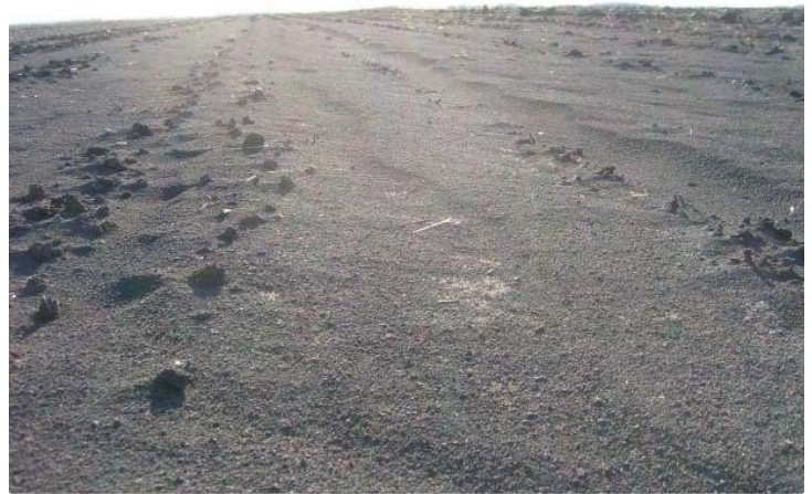
Figure 6. Smoothing of soil after a dust storm in the Red River Valley due to soil movement and soil loss.