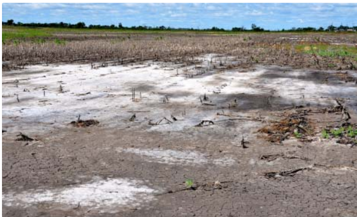
Figure 5. Salt-affected soil with indicator plants and surface whitiness.

In the contest, salts in the topsoil and subsoil count toward the presence of soluble salts. Look around the contest-staked area for indicator plants. These plants,